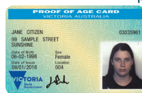
Proof of age card