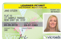
Victorian learner permit