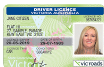
Australian driver licence