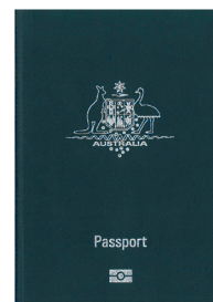
Australian or foreign passport